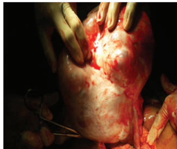
Fig 1 : Specimen of Ovarian Cyst

Treatment Given: Laparotomy was done and proceeded with Total Abdominal Hysterectomy, Right Ovariectomy and Left salpingo-oophorectomy and infracolic omentectomy. Intra operative findings - Right ovarian tumor 20x20cm size, weighing 3 kg, irregular margins with smooth wall and cystic in consistency, capsule intact. (Fig 1). Uterus and cervix normal, No omental deposits or visceral deposits. Nodes not palpable